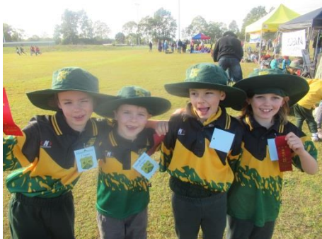
Junior Relay Team