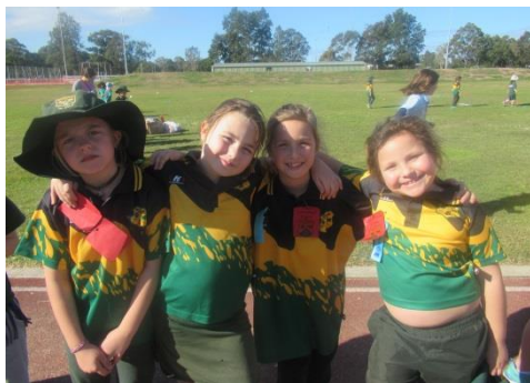
PSSA Small Schools Athletics Carnival