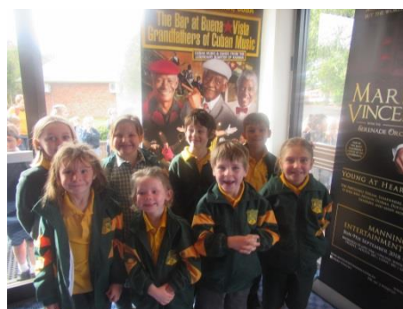
Wattle excursion to The Very Hungry Caterpillar